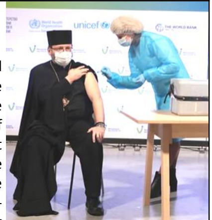
His Beatitude, Patriarch Sviatoslav receives his vaccination March 16.

As Covid-19 continues to spread in our communities around the world and as new variants continue to appear, we are faced with the question as to whether or not we should be getting vaccinated when it is an option. Often the question of the morals of receiving the vaccinations arises. And the best answer is that yes, we should all be doing our part to receive the vaccine. When the opportunity is there and when we are eligible, we should go and get vaccinated. Our Patriarch Sviatoslav had this to say in an interview: "Obviously, the safety or effectiveness of the vaccine is within the competence of physicians. When it comes to the perception of vaccination as a phenomenon, there is no religious reason to avoid it. Today, all world leaders: the Holy Father, Patriarch Bartholomew, spoke in unison that vaccination is needed. Because this is one of the possible ways to prevent this disease." "The document [put out by the Vatican] states that not only can you be vaccinated, but it is also a moral imperative. We must take care of our lives and the health of ourselves and our neighbors, and therefore we must take care of the common good and obviously work on it together," the Head of the UGCC added.